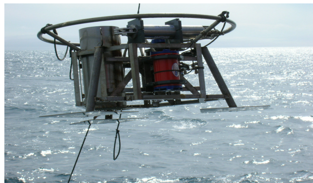
Fig 4: Seabed Lander

The Laboratory will be grateful if all shipping keeps at least four cables clear of the instrument.