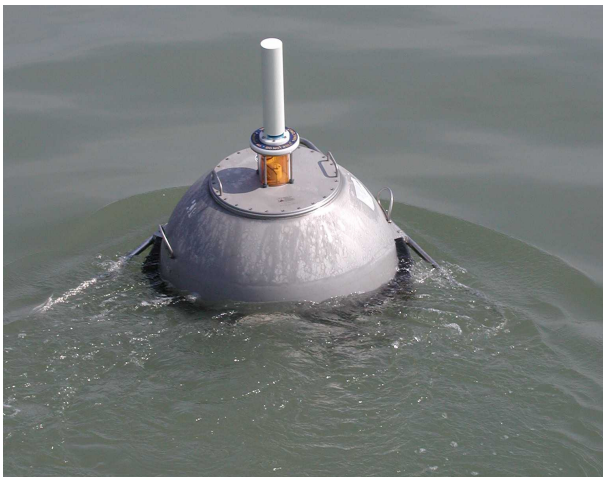
Fig 2: Waverider Buoy

Wave data is freely available in near real-time from www.cefas.co.uk/wavenet