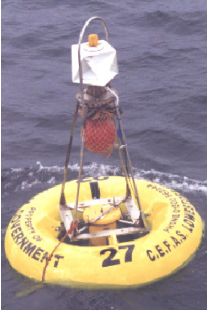
Fig1: Toroidal Guard Buoy