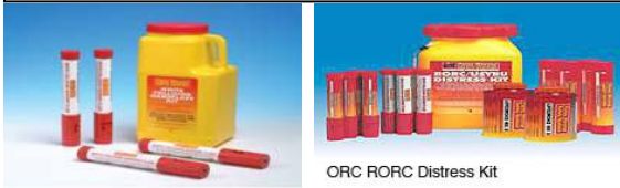
Collision Warn Off Kit